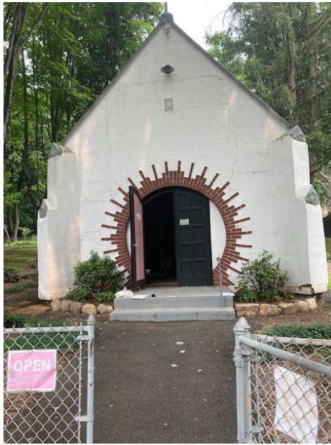
St. Therese Chapel