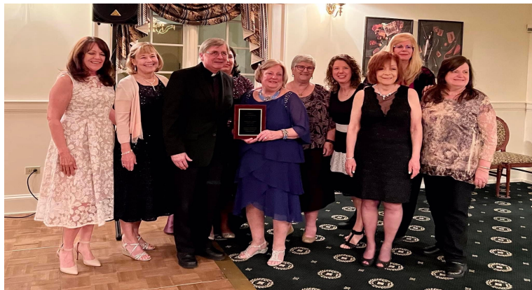
LEGACY AWARD PRESENTED TO SANTA MARIA 1179 BY SACRED HEART CHURCH AND SCHOOL.