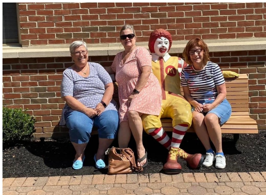
SANTA MARIA 1179 AT RONALD MCDONALD HOUSE IN CAMDEN.