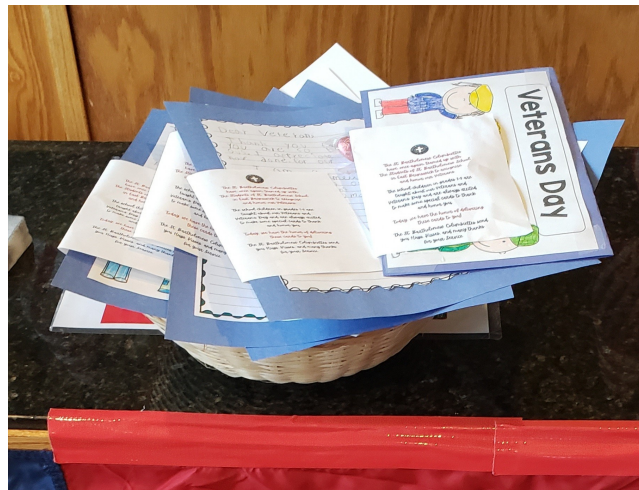
Veterans Day cards made by the St. Batholomew School students and distributed at the local Applebee's.

Another yearly activity for the fall season is the distribution of cards made by the St. Bartholomew school kids to Veterans on Veterans Day at our local VFW and at Applebee's restaurant. Our members also sign a card that we attach to the kids' cards. This year we distributed 197 cards.