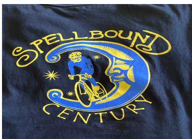
BIKE RACE T SHIRTS