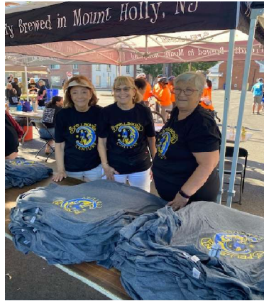
FUN HELPING AT THE BIKE RACE.