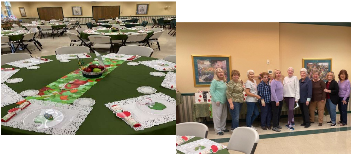
Our Tea Table Setting and Sister Columbiettes hard at work.

We look ahead to our November meeting when we will have a Memorial Mass for our deceased members, again joining the Knights to honor our deceased brothers. We all wish you the very best Thanksgiving and Christmas holidays – hoping to see many of you at the December Western Chapter.