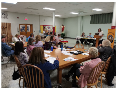
Photos from our new location

In October, the Columbiettes were attending the Life Chain Rally on the Green in Newton, which was a rally to Save Unborn Children. At the conclusion of the rally a rosary was should by all in attendance.