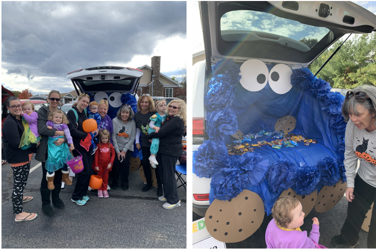
Celebrating Trunk or Treat with Cookie Monster

A few members tapped into their creative juices and decorated their car into a “Cookie Monster” for a “Trunk or Treat” celebration at a local nursing home where residents came outside to watch the staff’s children parade in Halloween costumes for cookies, candy, and other treats. Oh, yes, we gave out cookies.