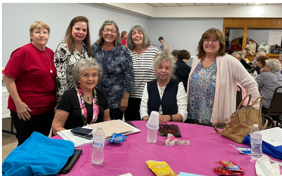
Attending State training