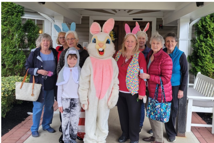
Immaculate Conception Palm Sunday Easter Bunny Visit