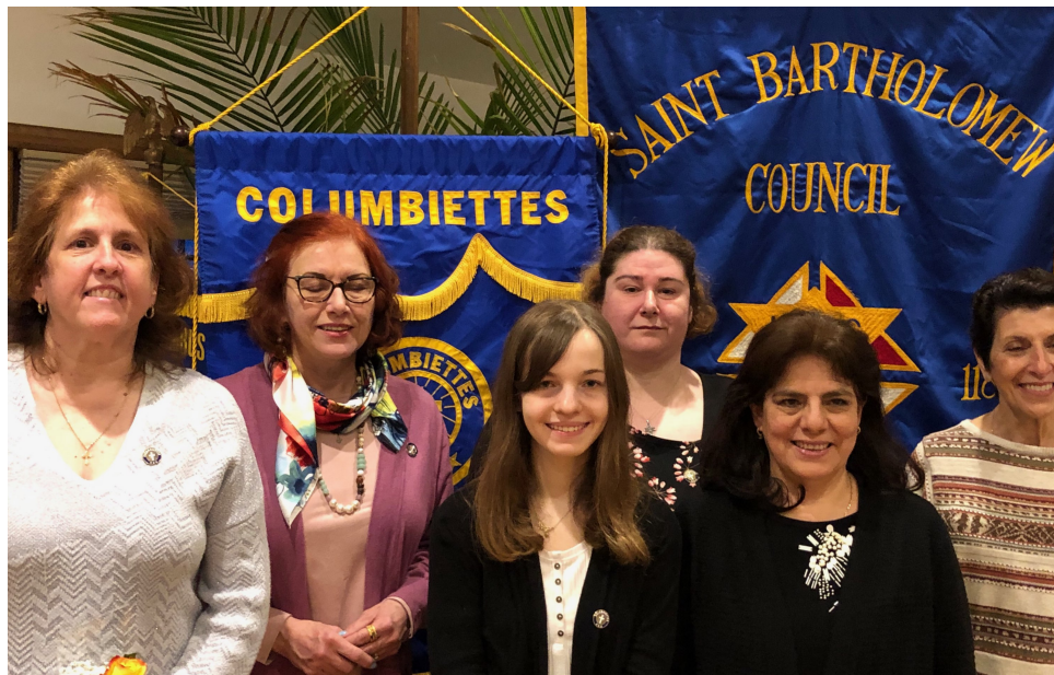
Initiation Ceremony at St Bartholomew's.

From our Chapter to yours prayers for a safe and as normal as is possible summer to ALL of my Sister Columbiettes. God's Blessings, always.