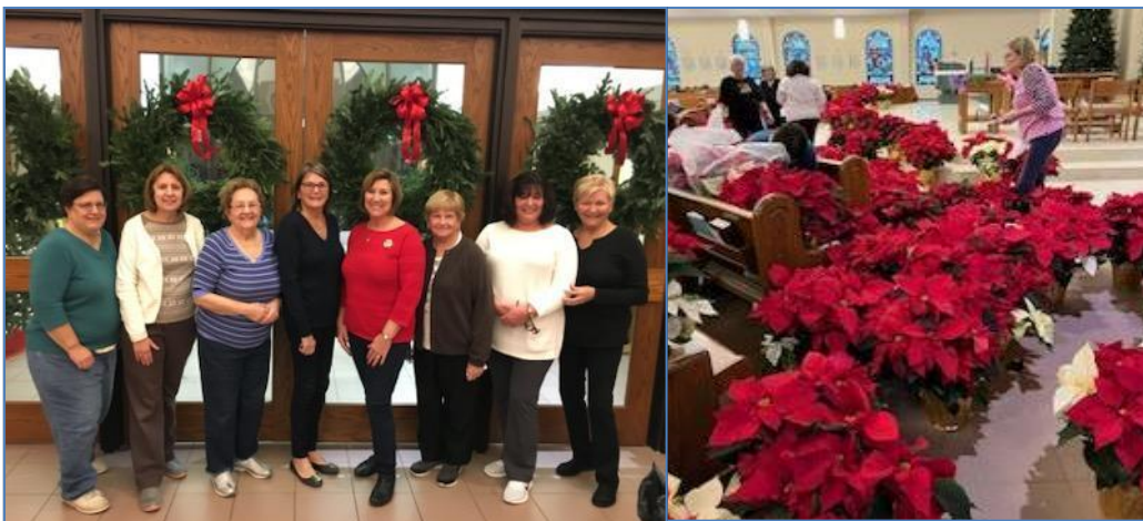
Holiday Committee decorating the Church

Our Lady of Peace Columbiettes' Holiday Committee has the distinct pleasure of decorating the church at Christmas time. With donations given in memory of loved ones, they were able to blanket the church with beautiful red poinsettias. Due to the generosity of our parishioners, they were also able to buy a large nativity set for the outside entrance of the church. For our Holiday Committee, decorating the church has become a labor of love and one they look forward to each year.