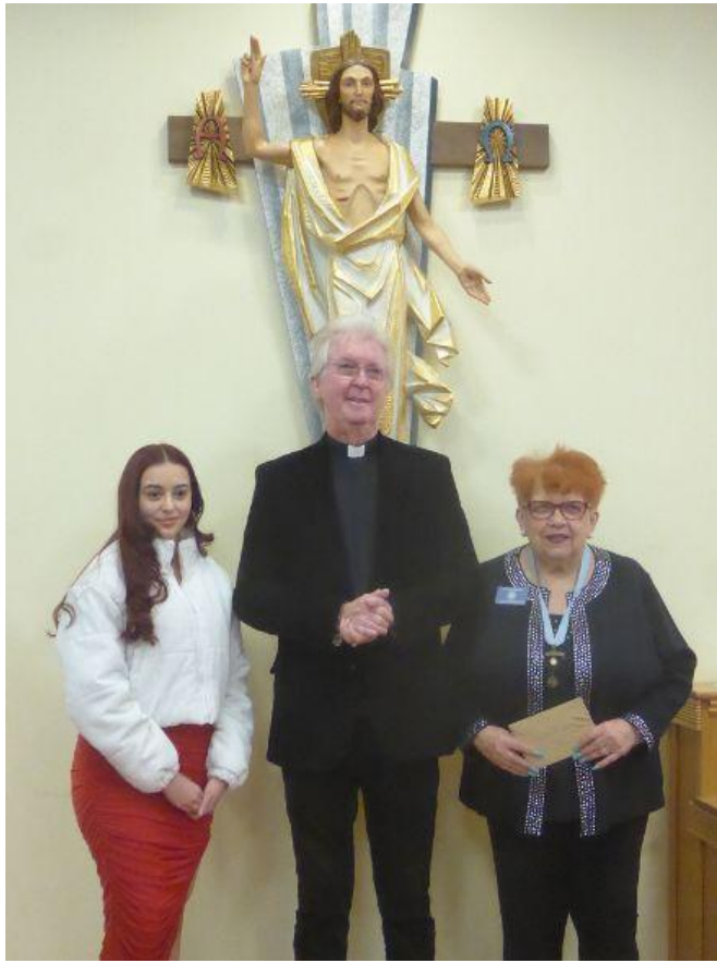
ST DAVID THE KING SCHOLARSHIP AWARD