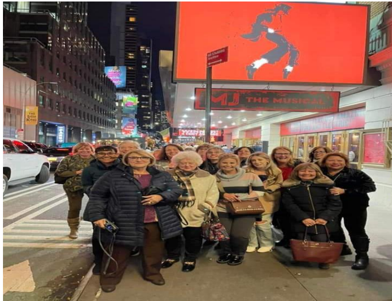
The Columbiettes on Broadway to see MJ the Musical

Our newest committee, “Just for Fun”, organizes and plans “fun” activities for our members who work so hard during the year to help others. We have enjoyed movies like Elvis Presley, 80 for Brady, dinners at local restaurants and have gone to see Broadway shows such as Mr. Saturday Night, MJ: the Musical and most recently A Beautiful Noise: The Neil Diamond Story. During the New York City trips, our members have traveled in a limo bus and a stretch SUV limo; we are forever spoiled!!! As the weather warms up, we plan to organize some outdoor trips so we can continue to enjoy each other’s company.