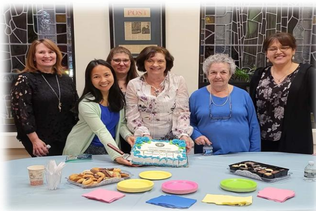
April Columbiette Initiation - 6 New Members