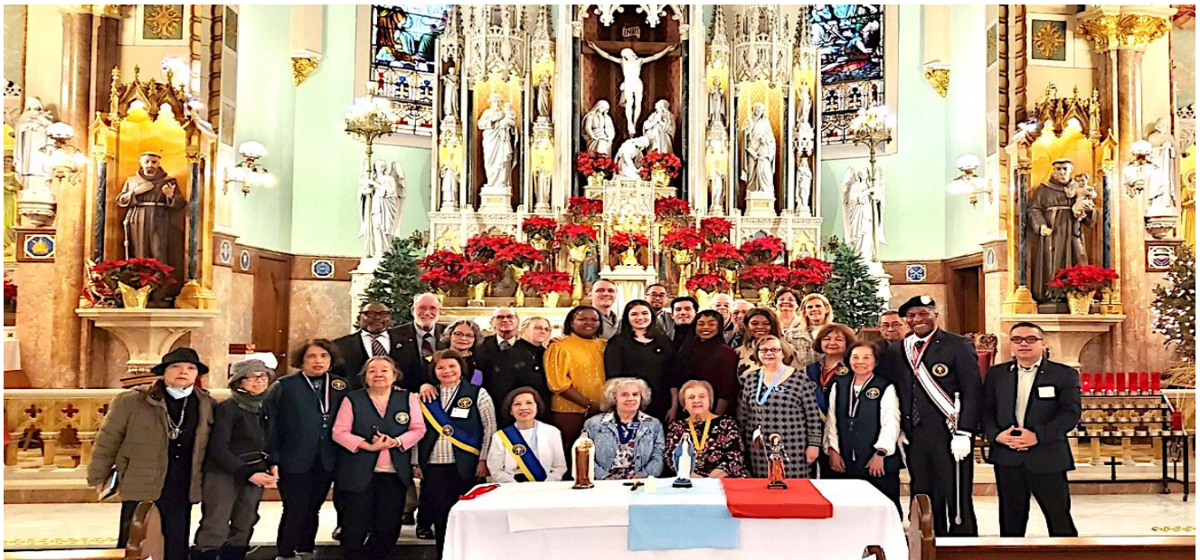
GREETINGS FROM OUR LADY OF PERPETUAL HELP AUXILIARY JC