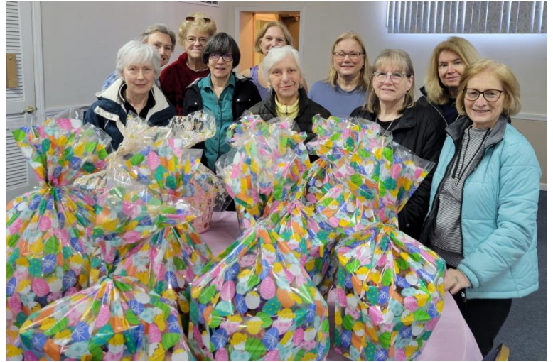
Immaculate Conception St. Patrick's Day Carnation Sale