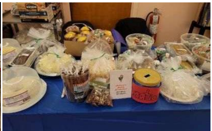
From our Bake Sale.