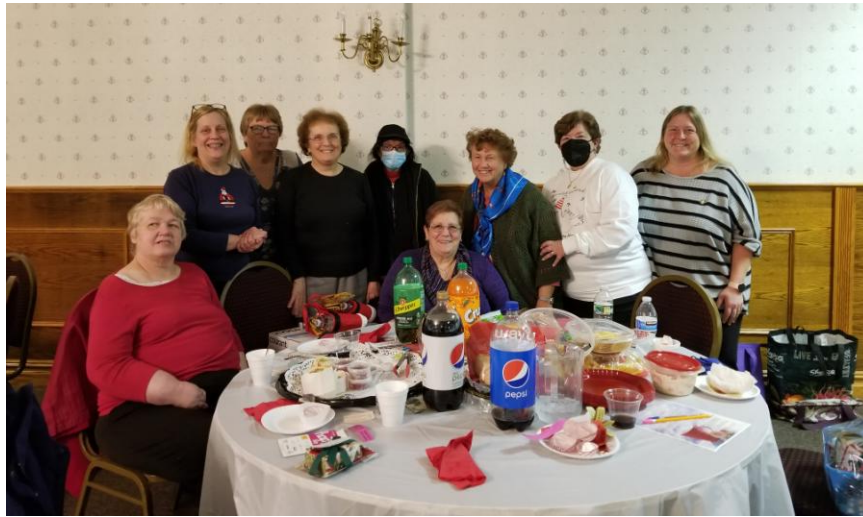
At our November Chapter Meeting.