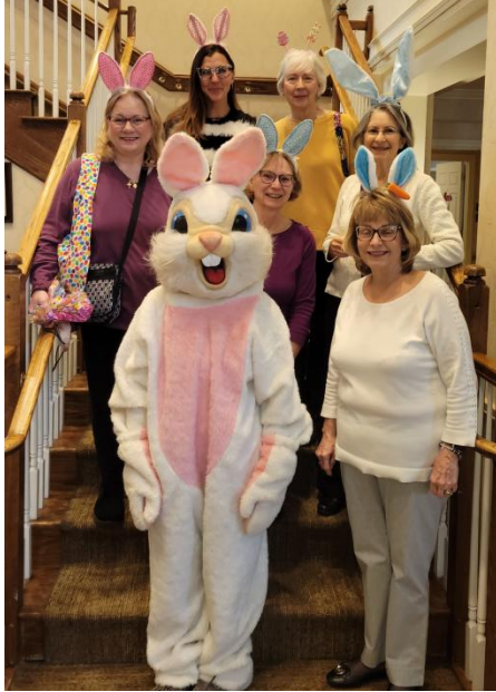
Immaculate Conception Palm Sunday Easter Bunny Visit