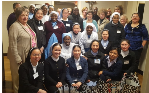
Columbiettes had a wonderful visit with the convent nuns who enjoyed friendship, fellowship and goody bags.

COUNT YOUR BLESSINGS. NAME THEM ONE BY ONE. COUNT YOUR MANY BLESSINGS SEE WHAT GOD HAS DONE.